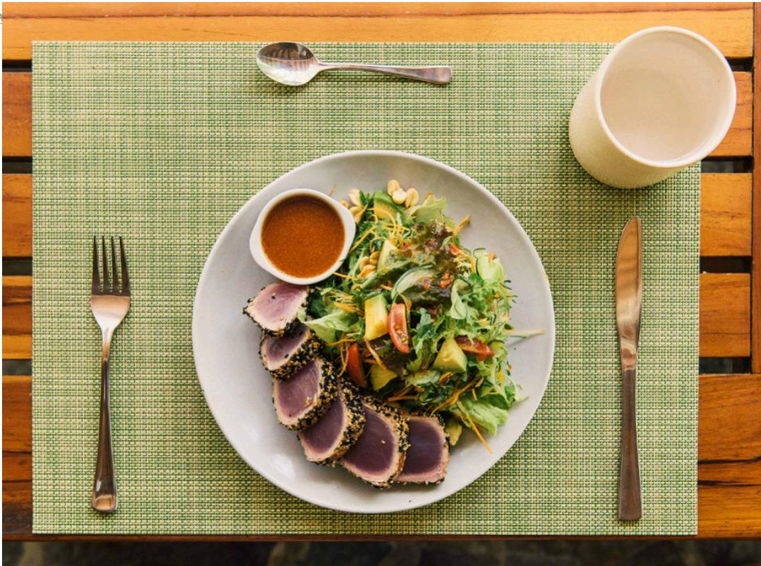
Classic Caribbean dishes transmit a part of history. FLORBLANCA

The Caribbean Islands are a melting pot of cultures and flavors with each island offering its own distinct personality. Apart from its crystal-clear waters and white sandy beaches, the Caribbean offers a rich culinary experience. The islands, with their rich historic past and different cultures, serve as an amazing platform to explore the Caribbean cuisine. Classic dishes transmit a part of history and keep traditions alive. All in all, it's a great time for any travel foodie to discover the eclectic tastes of the Caribbean Islands.