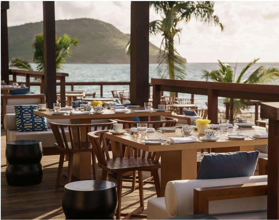
The Great House Dining offers pristine ocean views. PARK HYATT ST. KITTS