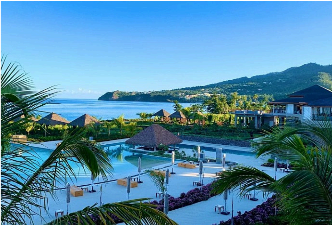
View over the Cabrits Resort & Spa Kempinski, Dominica

This is Range's second major project to be completed in the eastern Caribbean, following the successful opening of the acclaimed Park Hyatt St Kitts in 2017. Range's latest project, the Six Senses La Sageesse in Grenada, launched earlier this year with construction to commence imminently. These developments confirm Range Developments as the leading developer of citizenship-by-investment (CBI) projects in the Caribbean.