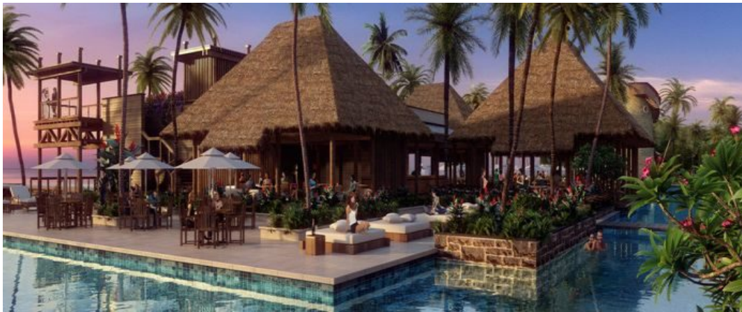
New Kempinski resort in Dominica opens this fall and will help transform the island's promising ecotourism sector