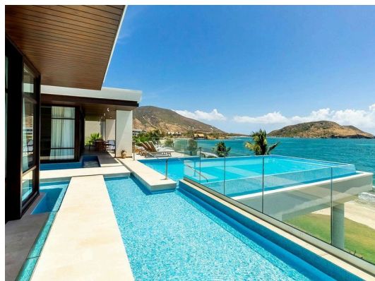
Park Hyatt St. Kitts