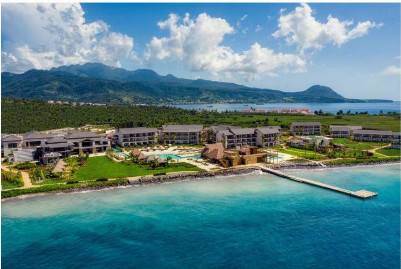
The Cabrits Resort & Spa Kempinski, Dominica.

Those hotels, two of which are already completed in the Caribbean – Park Hyatt St. Kitts and the Cabrits Resort & Spa Kempinski, Dominica – boost the tourism sector of the islands and also provide a vehicle for high-net-worth individuals to gain second citizenship through investment.